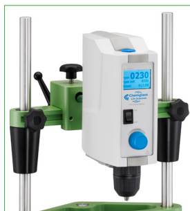
6a Digital Overhead Stirrer, 115v

Approx. Stand Dimensions: 15.25 W x 17.25 D x 44"H