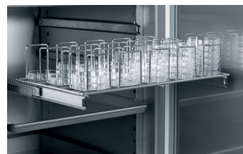
Rack for petri dishes