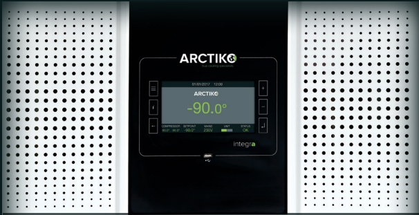
The new developed V700 controller comes as standard on the new INTEGRA range.