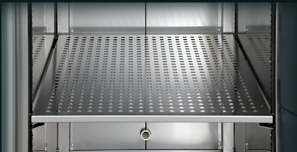
The shelves in the new INTEGRA range are perforated and easy adjustable in order to offer best flexibility for your storage needs.