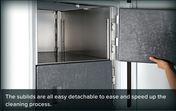
The sublids are all easy detachable to ease and speed up the cleaning process.