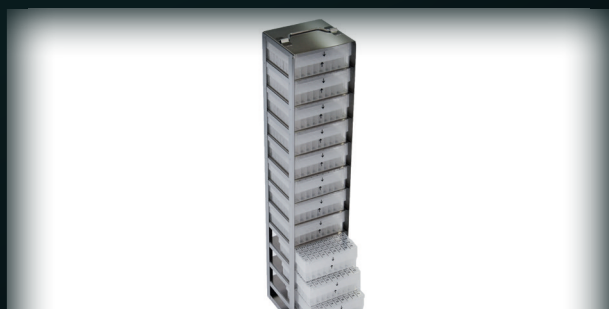
Optimal storage capacity and overview of the stored samples with the stainless steel front rack storage system