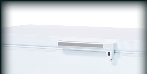
Lock on handle for optimal security of the valued samples. Comes as a standard feature with key included.