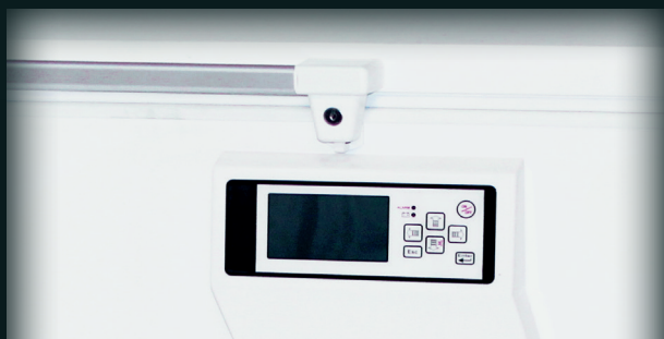
User friendly G214 controller standard in ULTF range. Includes different alarms as; visual, acoustic, open door and more.