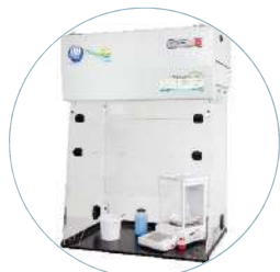
XIT Plus Larger cabinets, with more features