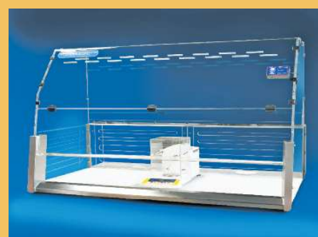
For installation into existing ducting