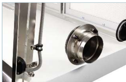
Waste bag port