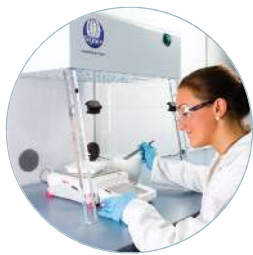
F3-XIT Small footprint weighing cabinets

For protecting the operator from hazardous airborne particulates and powders