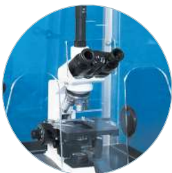
Specialist application and custom built Examples include: Asbestos Inspection Cabinets