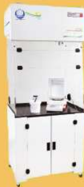
XIT Plus on optional