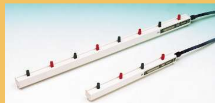
Ionising bars eliminate dust attraction and control the static environment.