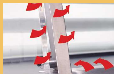
Air flow pattern over and under aerofoils.