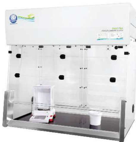
Excel Plus - Recirculatory Filtration