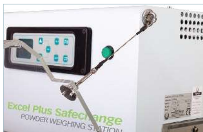
Door open stay