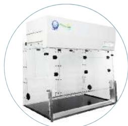
EXCEL Plus For more demanding weighing applications turbulent free air flow