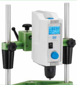
6A. Overhead Stirrer, Digital 115v