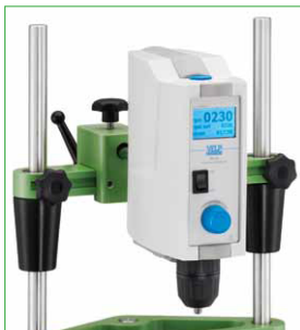
6A. Overhead Stirrer, Digital 115v

Approx. Stand Dimensions: 15.25 W x 17.25 D x 40”H